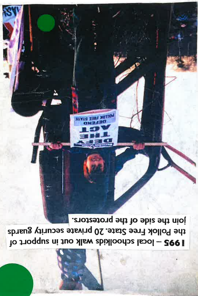
1995 – local schoolkids walk out in support of the Pollok Free State. 20 private security guards join the side of the protestors.